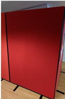
CHERRY RED PARTITIONS