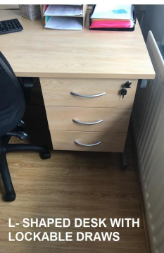
L- SHAPED DESK WITH LOCKABLE DRAWS