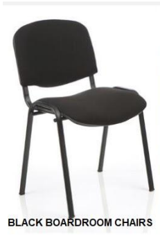
BLACK BOARDROOM CHAIRS